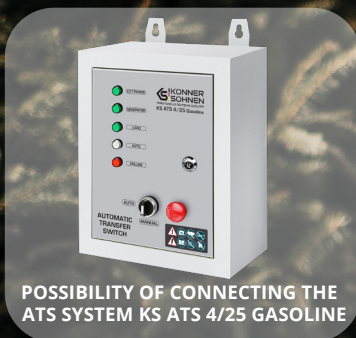
POSSIBILITY OF CONNECTING THE ATS SYSTEM KS ATS 4/25 GASOLINE